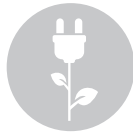
5. Carbon-free Power