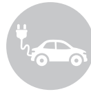
7. Electric Transportation