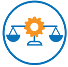
1. Equitable Workforce & Business Development