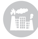
8. Support for Fossil Fuel Workers & Communities