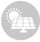
2. Energy Access & Solar for All