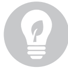
4. Energy Efficiency