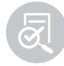
9. Utility Accountability

The Clean Energy Jobs Act - SB1718 (Castro) / HB804 (Williams) - sets a bold vision for Illinois's 100% renewable energy future and charts an equitable course that lifts up workers and families. CEJA dramatically expands career development and wealth building programs and prepares us for the transitions that lie ahead. Its dedication to climate and energy justice cuts across all sectors of the energy economy to ensure Black and Brown communities and communities of color benefit in the clean energy future. These fact sheets each represent one core component of CEJA - we encourage you to explore the entire series.