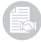
6. Capacity Market Reform